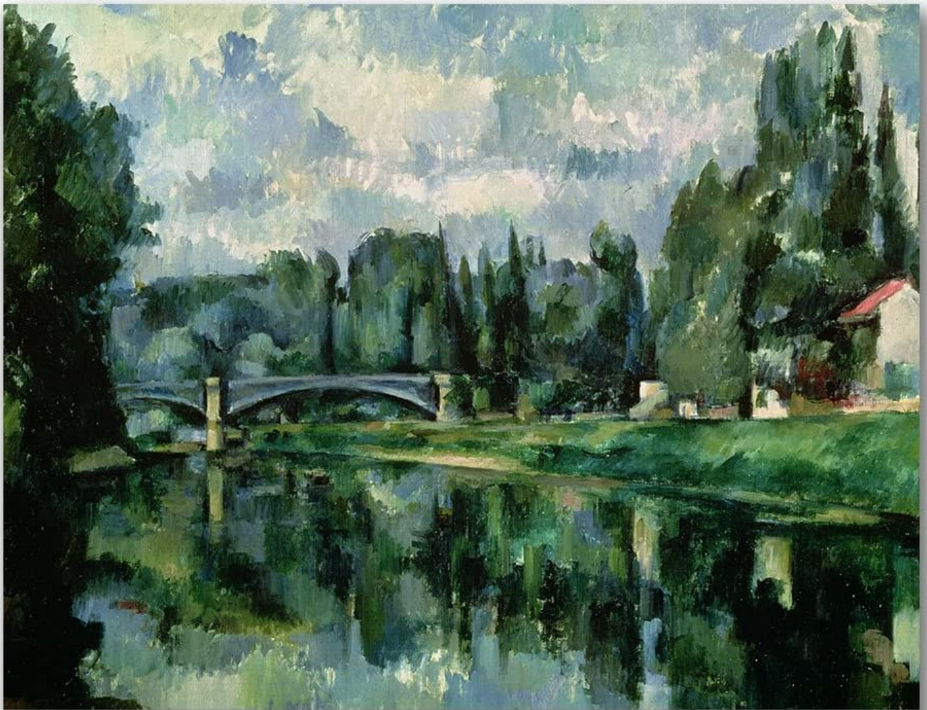
Figure 2. Paul Cézanne, Bridge over the Marne (1888).