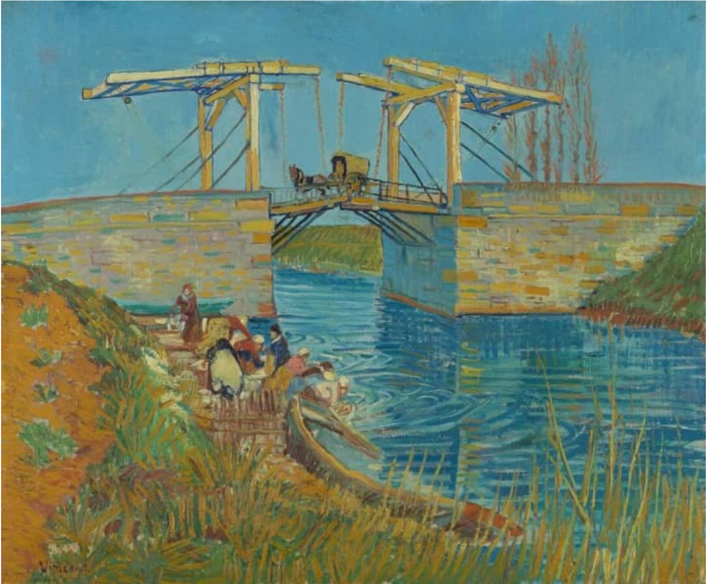
Figure 1. Vincent Van Gogh, Langlois Bridge at Arles (1888).

Finally, in Bierce's and Nabokov's prose, the bridge acts as a traditional symbol of transition to the other world. It is a place from which Peyton Farquhar goes to the world of visions and to the realm of the dead. Nabokov's bridge scene involves figures that are marked in black, i.e., the color of death.